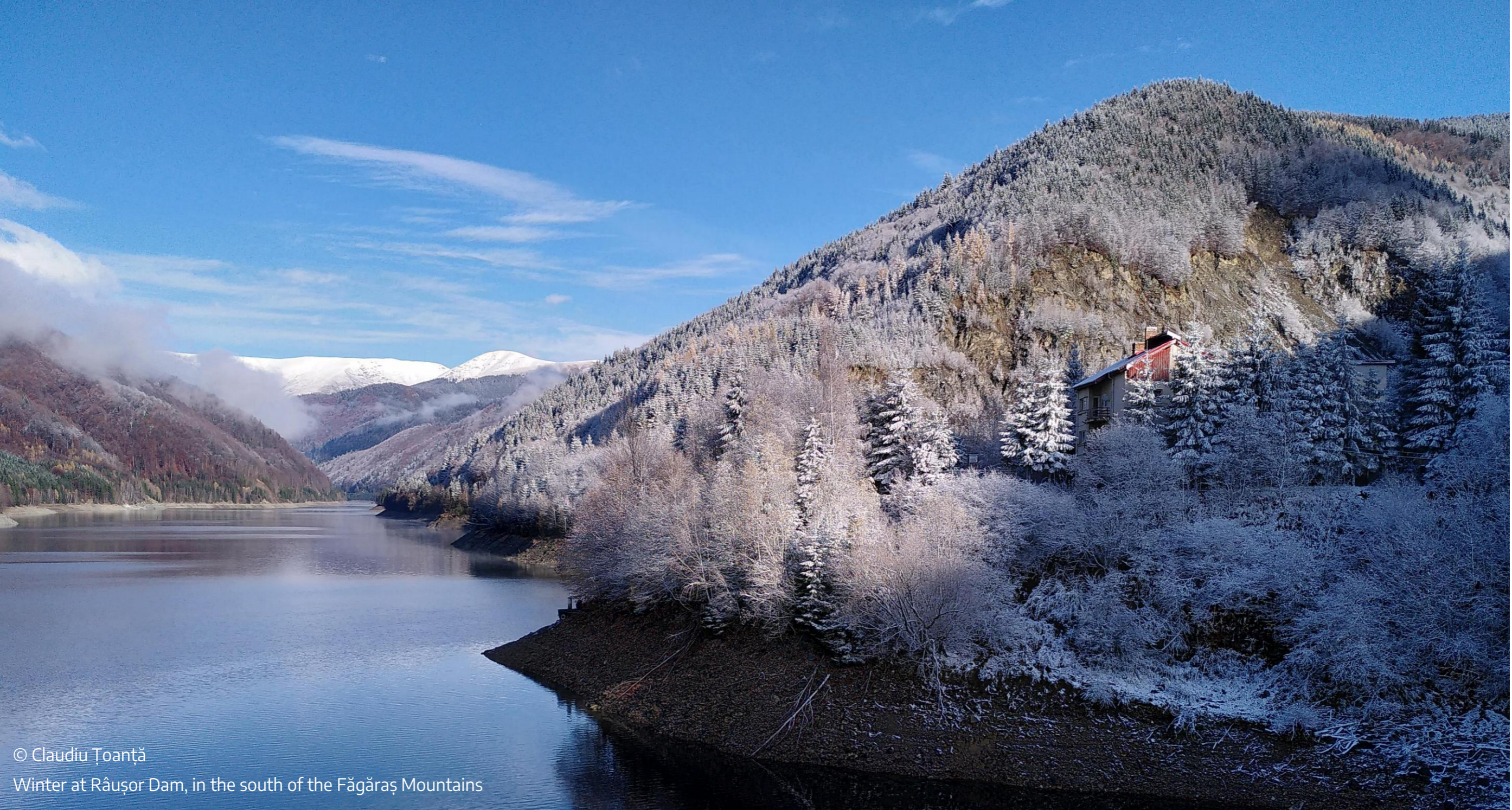
Winter at Râuşor Dam, in the south of the Făgăraş Mountains